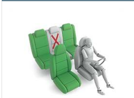
Maxi Cosi Cabriofix & EasyBase2 (Belt)