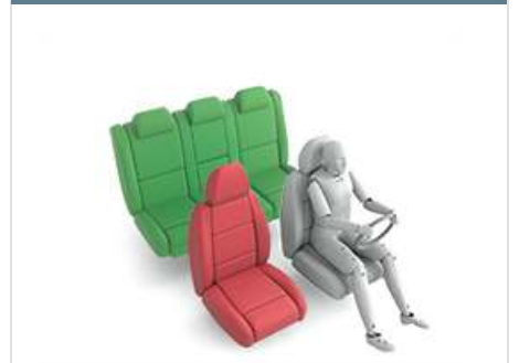
Römer King II LS (Belt)