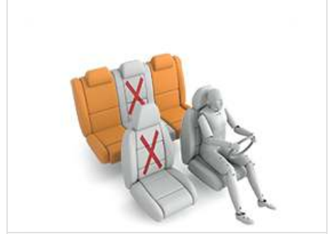
Römer Duo Plus (ISOFIX)